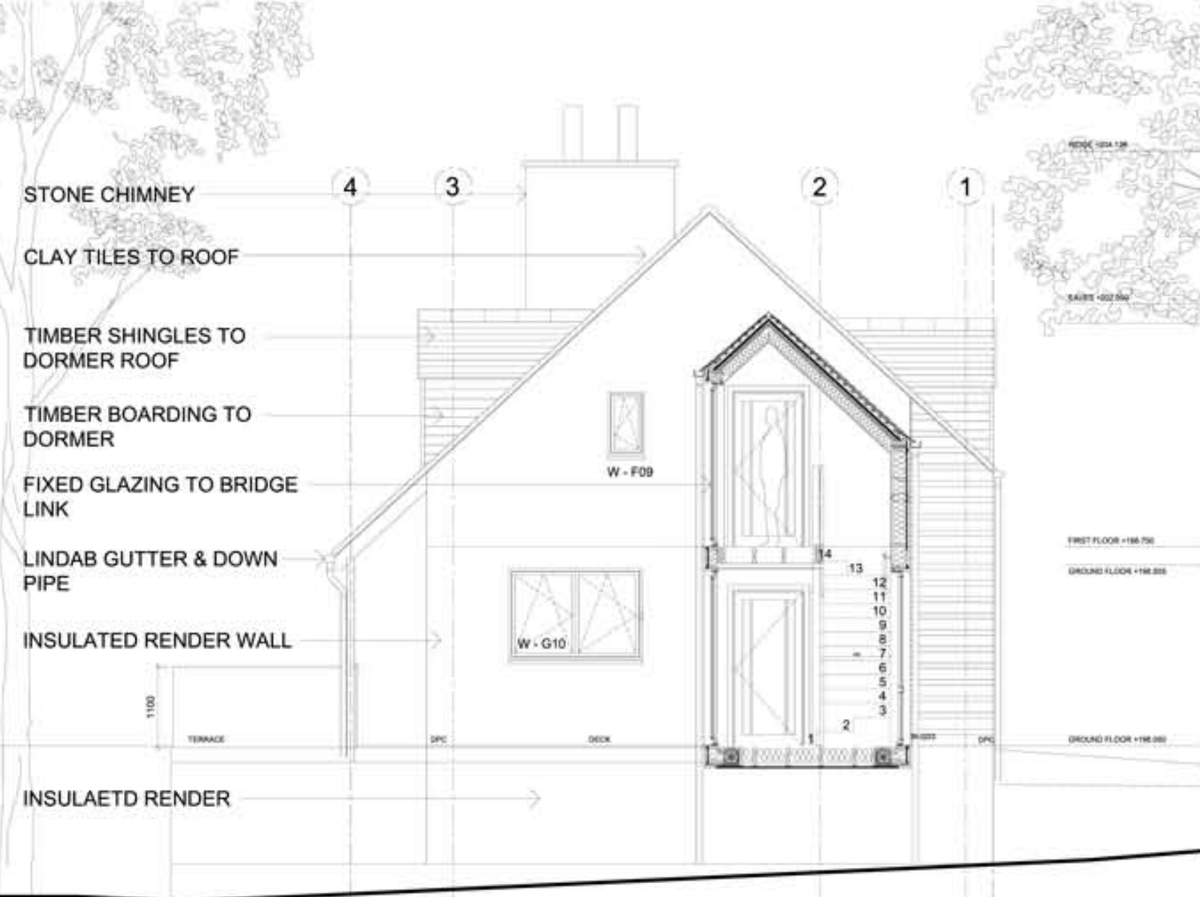
PROPOSED EAST ELEVATION MAIN HOUSE 1:50@A1