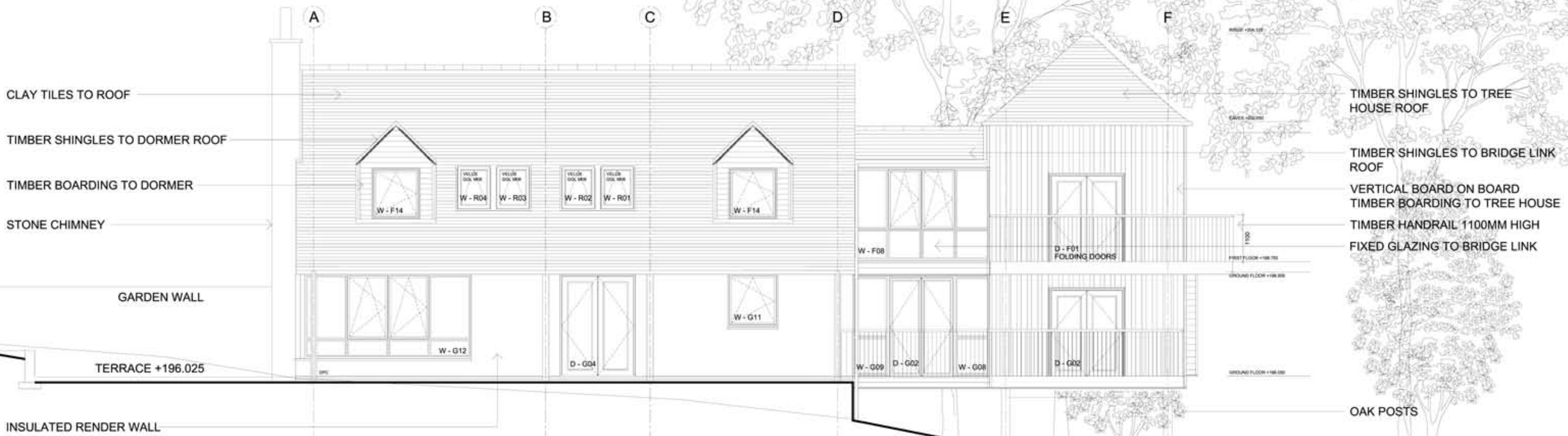
PROPOSED SOUTH ELEVATION 1:50@A1